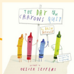
The Day the Crayons Quit by Drew Daywalt and Oliver Jeffers (illustrator)