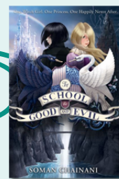
The School for Good and Evil by Soman Chainani