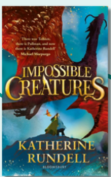
Impossible Creatures by Katherine Rundell