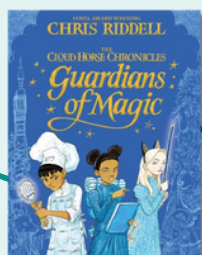
Guardians of Magic by Chris Riddell