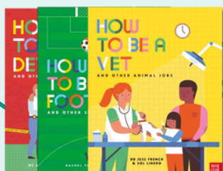
How To Be A... series by Nosy Crow