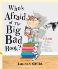
Who's Afraid of The Big Bad Book? by Lauren Child