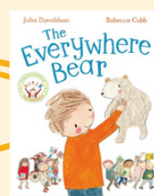
The Everywhere Bear by Julia Donaldson and Rebecca Cobb